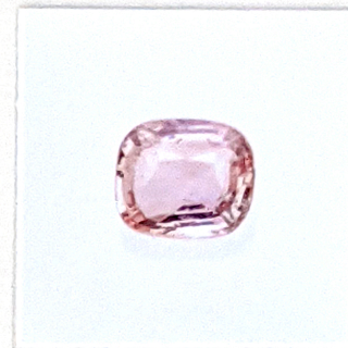
magnification approx. 1.5x